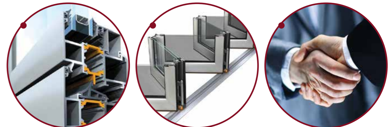
Establishing trade relations